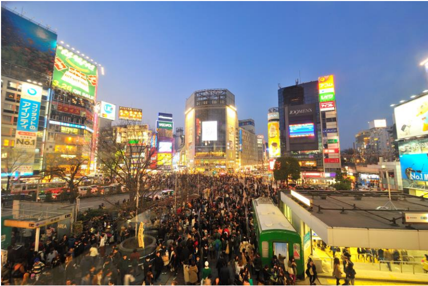
Outside Shibuya station, looking towards the pedestrian scramble

One of Tokyo's most lively and colorful neighborhoods, Shibuya is most famous as a youth fashion hotspot and the busiest road crossing you will ever see. Originally the site of a castle belonging to the Shibuya clan, since the introduction of the Yamanote Line it has become one of the main clubbing, shopping and entertainment areas in Tokyo.